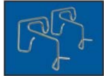
Wire attachment No. 348