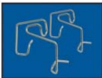
Wire attachment No. 348

Can be fitted with an aluminium louvre/anti-glare protection, easily fixed to the luminaire body. Mounted by means of wire attachment or direct to the luminaire body. Screwless connection over a 5-pole terminal block (2.5 mm 2 ) for through-wiring. Magma is also available with the reflector anti-glare protection DP+R (4162).