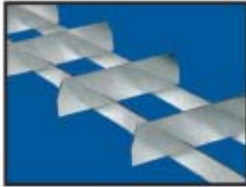
Aluminium louvre 4182/54