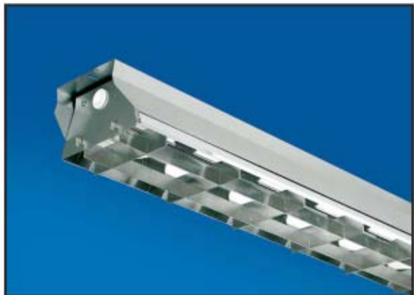
Luminaire 4182 equipped with an aluminium louvre