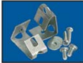
Wire attachment No. 343