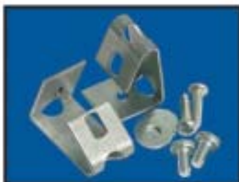
Wire attachment No. 343