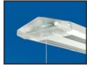
End-pieces of transparent polycarbonate