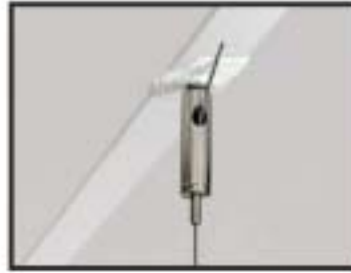
T-section clip with adjustable wire lock