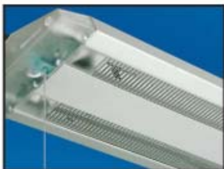
Aluminium blade baffle

Very suitable for the small office where the luminaire is intended for single use. Callisto 1042/54 DE is prepared for DimEasy control. DimEasy grants the user entire liberty to choose the level of brightness that he prefers. There is a built-in pull switch in the luminaire.