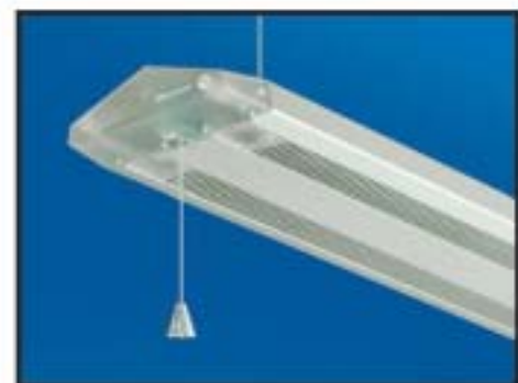
Callisto Dim Easy with pull switch