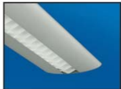
DP+R diffuser, simple to remove to replace fluorescent lamps.