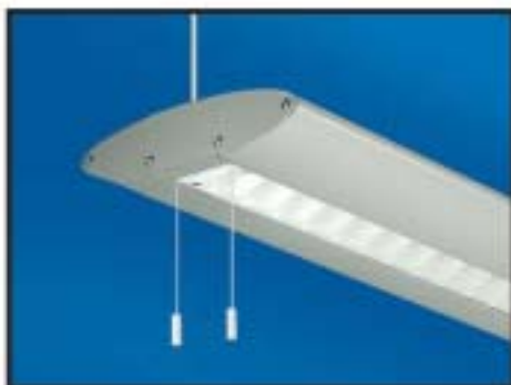
Cressida Basic. Without dust cover and with white plastic pull switches.

Cressida works on the principle; one lighting unit one office. Cressida combines indirect light with direct light. It is equipped with two pull-switches for individual control of uplight and downlight. Cressida is equipped with DP+R, a low luminous and efficient reflector louvre with a patented technique. Aluminium reflectors of a diffuse material and a total reflection of more than 90%. The luminaire is very suitable for use at display terminal workstations. Cressida 3963/28 NS is equipped with a presence sensor for increased comfort and lower power consumption.