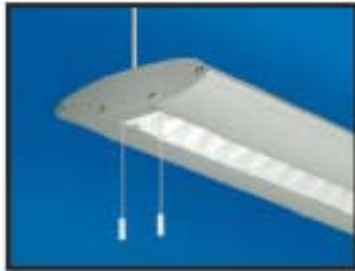
Cressida Basic Without dust cover and with white plastic pull switches.