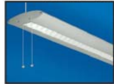
Cressida Timeless with pure style ellipse shape.