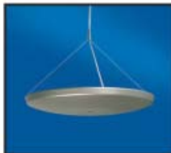
Galatea uplight see separate product sheets