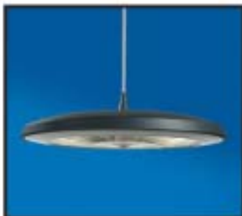
Galatea downlight black

(See separate product sheets for Galatea Uplight and Galatea Recess.)