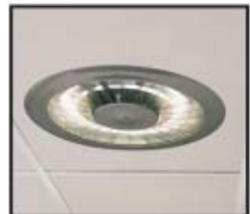
Galatea recess see separate product sheets