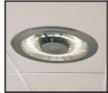
Galatea recess see separate product sheets