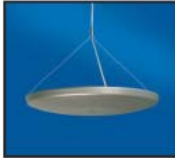
Galatea uplight see separate product sheets