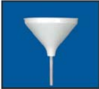
Ceiling cup on special request