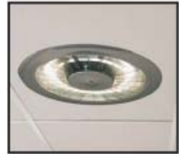
Galatea recessed See separate product sheet