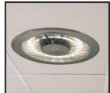
Galatea recessed see separate product sheet