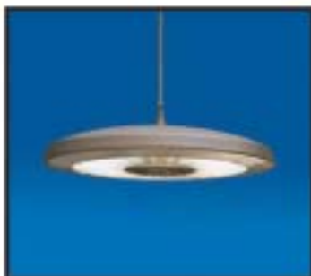
Galatea downlight see separate product sheet

Galatea Uplight uses the reflexes of bright ceilings to create a broad light distribution, for instance in open plan offices, where flexible lighting solutions are required. The uplight is a comfortable light and therefore preferred in lobbies and assembly halls. A good solution is to use the Galatea uplight as general lighting matched with Galatea downlight as local oriented lighting. (See separate product sheets for Galatea Downlight suspended and recessed.)