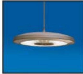
Galatea downlight See separate product sheet